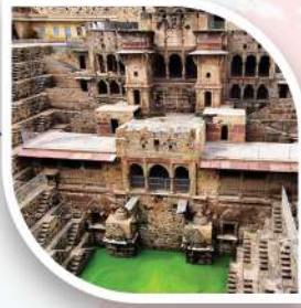
Rani ki Vav