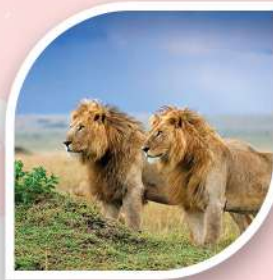
Gir National Park