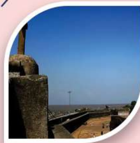
Nani Daman Fort