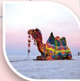
Rann of Kutch