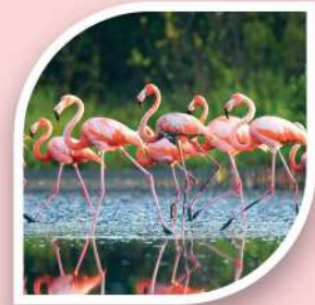
Nalsarovar Bird Sanctuary