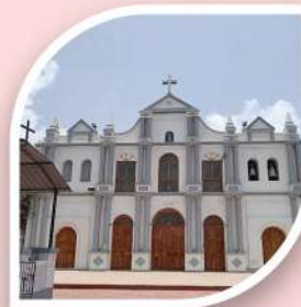
Church of Our Lady of the Sea