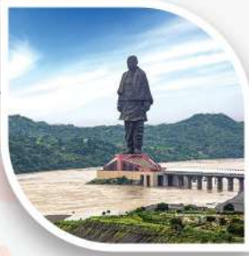
Statue of Unity