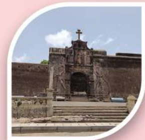
St. Jerome Fort