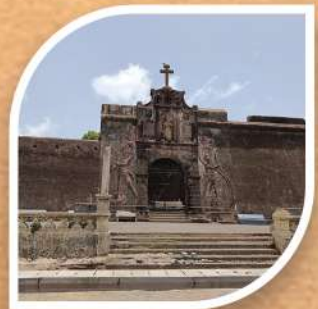
St. Jerome Fort