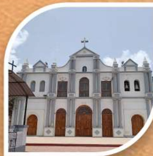
Church of Our Lady of the Sea