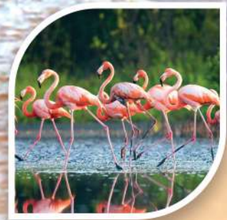
Nalsarovar Bird Sanctuary