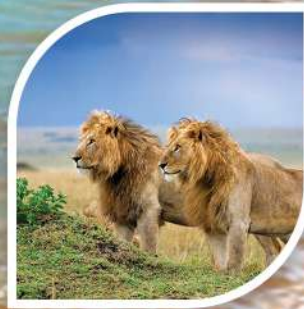
Gir National Park