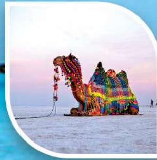
Rann of Kutch